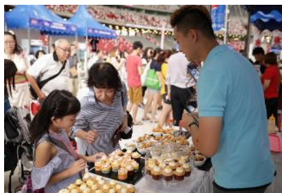
Visitors are spoiled for choice by the range of food and beverage on offer