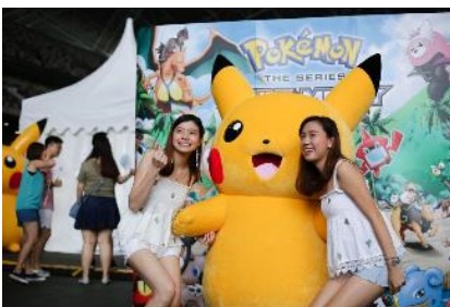
Fans posing with the Pikachu mascot at the Meet & Greet sessions