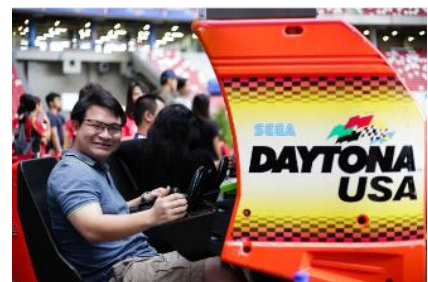
Reliving arcade memories with the Daytona car racing video game

Hi-res images can be downloaded here: https://bit.ly/2M89BAN