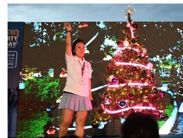
Official ChariTree light-up of the Stadium Riverside Walk

More images can be downloaded here: https://bit.ly/2FXfWBB