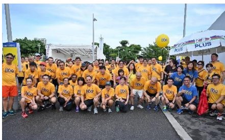
B60 runners kicked off the day with a 7am run around the Singapore Sports Hub